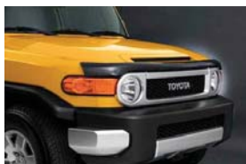
Hood Protector $155 Installed MSRP*