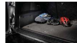
Carpet Cargo Mat $69 Parts Only MSRP**