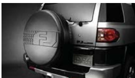
Spare Tire Cover $169 Installed MSRP*