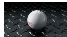
TRD Shiftknob $59 Installed MSRP*

© 2010 Toyota Motor Sales, U.S.A., Inc. Produced 02.15.10