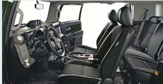
FJ Cruiser 4WD shown in Dark Charcoal with available Upgrade Package #2. 2008 model shown. [6]