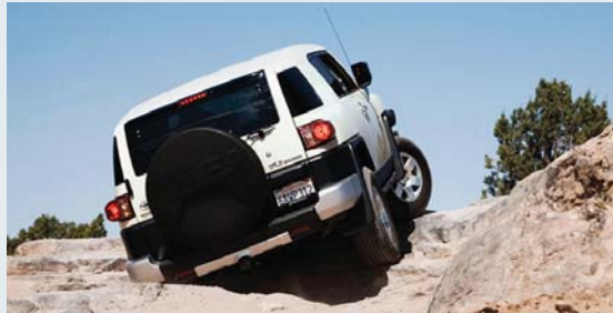
FJ Cruiser shown in Iceberg with available Upgrade Package #2. [6]