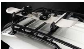
Ski/Snowboard Attachment w/ Adaptor $224 Parts Only MSRP**