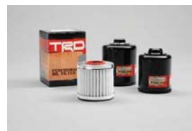
TRD Oil Filter $13 Parts Only MSRP**