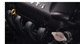
TRD Radiator Cap $37 Parts Only MSRP**