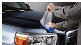
Paint Protection Film $395 Installed MSRP*