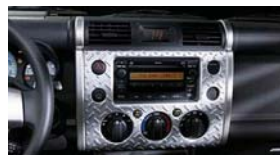
Molded Dash Applique $350 Installed MSRP*