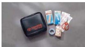
First Aid Kit $29 Installed MSRP*