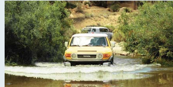
FJ Cruiser shown in Sun Fusion and Silver Fresco Metallic with accessory rock rails.