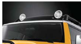
Off-Road Lights w/ Air Dam $799 Installed MSRP*