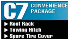
Roof Rack, Towing Hitch and Wire Harness, Spare Tire Cover $1,167 Installed MSRP*