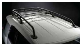
Roof Rack $649 Installed MSRP*