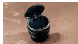
Ashtray Kit $17 Parts Only MSRP**