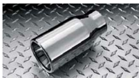
Exhaust Tip $75 Installed MSRP*