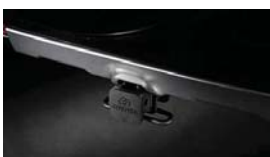
Towing Hitch & Wire Harness $349 Installed MSRP*