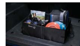
Cargo Tote $40 Parts Only MSRP**