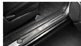
Billet Door Sills $149 Installed MSRP*