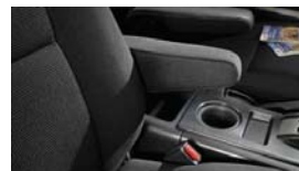
Armrest $125 Installed MSRP*