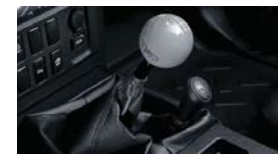
TRD Quickshifter $450 Installed MSRP*