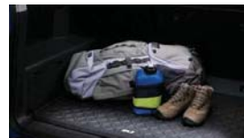
All Weather Cargo Mat $79 Parts Only MSRP**