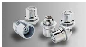
Alloy Wheel Lock Set $81 Installed MSRP*