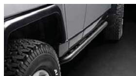
Rock Rails $575 Installed MSRP*