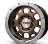
TRD 16" Off-road Beadlock Wheel $219 Parts Only MSRP**