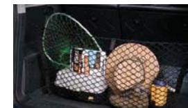
Cargo Net $49 Installed MSRP*