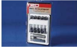
TRD Wheel Locks $150 Parts Only MSRP**