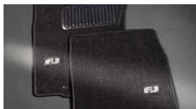
Carpet Floor Mats & Cargo Mat $199 Installed MSRP*