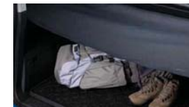
Cargo Cover $90 Installed MSRP*