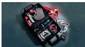
Emergency Assistance Kit $70 Installed MSRP*