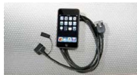
iPod Interface $299 Installed MSRP*