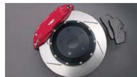
TRD High Performance Brake Kit $2,195 Installed MSRP*