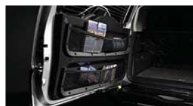
Rear Door Storage Net $89 Installed MSRP*