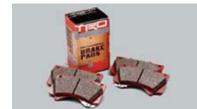
TRD Performance Brake Pads $95 Parts Only MSRP**