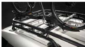
Bike Rack Attachment - w/ Adaptor $274 Parts Only MSRP**