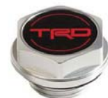
TRD Oil Cap $45 Parts Only MSRP**